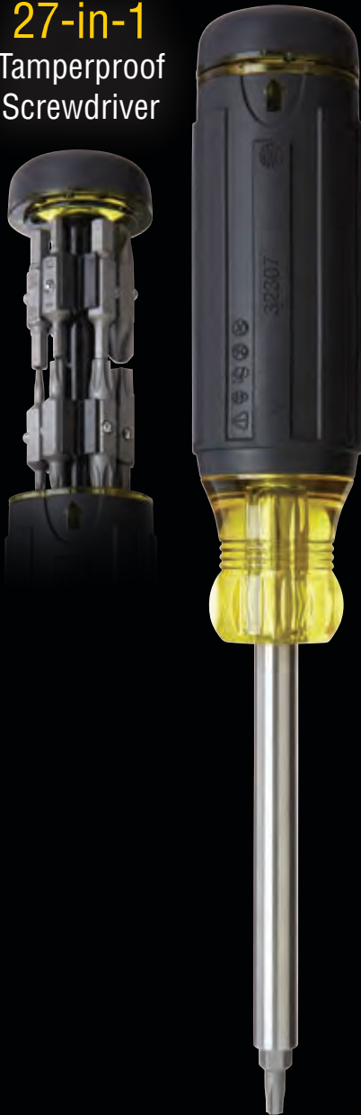
27-in-1 Tamperproof Screwdriver